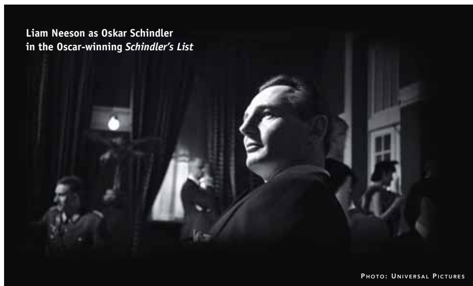
Liam Neeson as Oskar Schindler in the Oscar-winning Schindler's List

Zaillian likes to write outside, at a table on his back patio. "I do it every day: bankers' hours—10:00 a.m. to 4:00 or 5:00 p.m. It's a job. So in terms of the time, that's what I do. In terms of the actual work, that depends on what stage I'm at. I spend a lot of time outlining, more time outlining than writing.