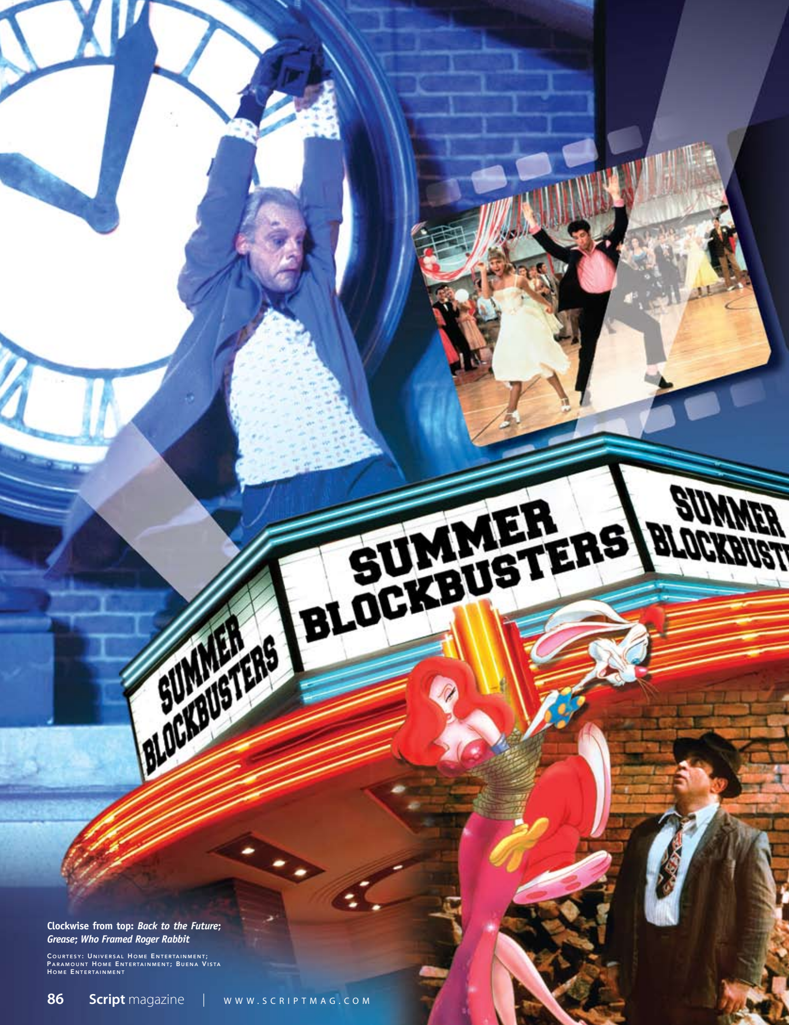
Clockwise from top: Back to the Future ; Grease ; Who Framed Roger Rabbit